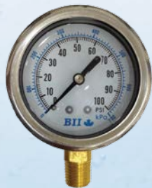
Pressure Gauge Part No. - PGL-0250