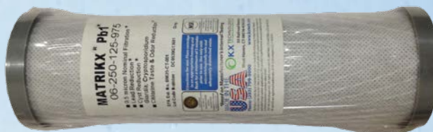
0.5 Micron Post Filter Part No. - ERV-F2