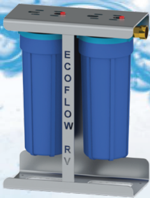
2 Filter Unit Part No. - EFSRV-2