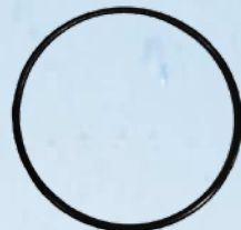
O Ring Part No. - 151121