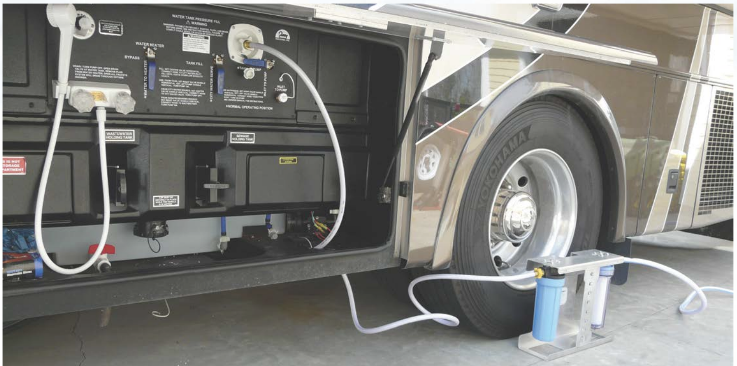
RV Ecoflow® Unit Installed Inline with an Available Water Source.