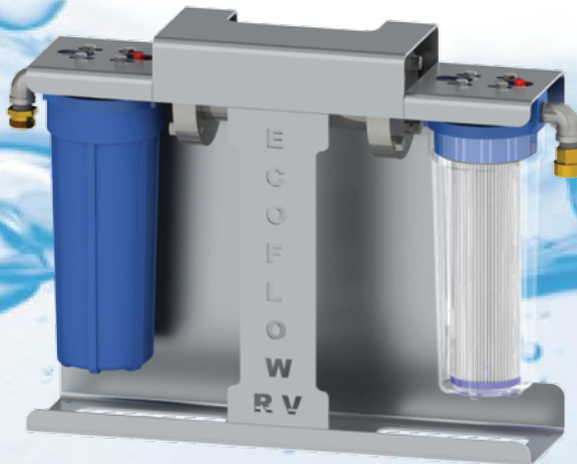
Ecoflow® RV Filter Unit Part No. - ERV-1