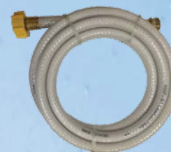
10' Hose Part No. - EFR-H10

All Materials Used to Manufacture This Unit are of Lead-Free Content