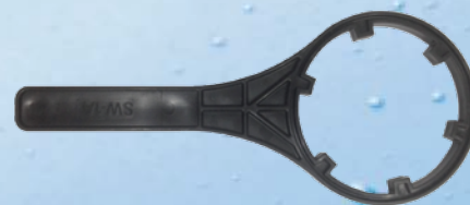
SW-4 Spinner Wrench Part No. - 150539