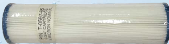
5 Micron Pre Filter Part No. - ERV-F1