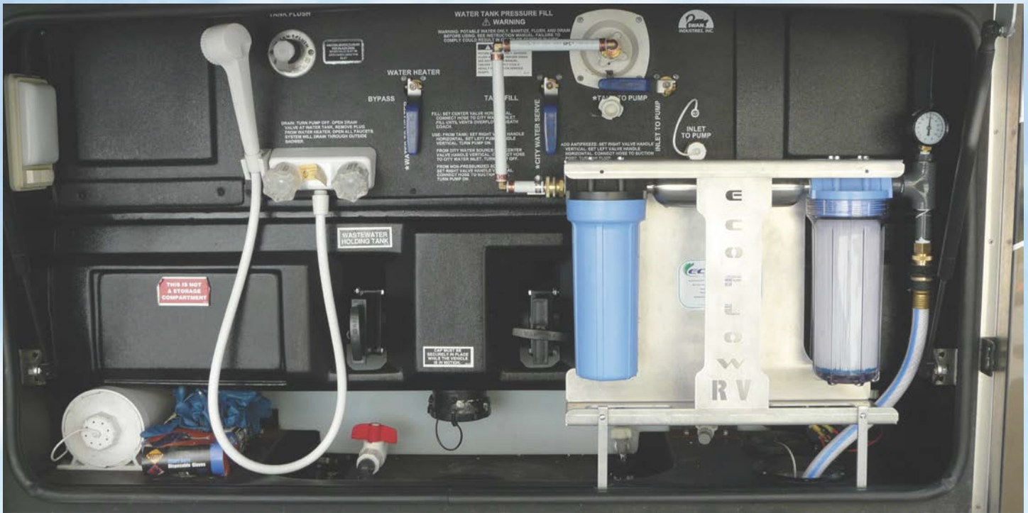
RV Ecoflow® Unit Installed on a RV using the Optional Mount.