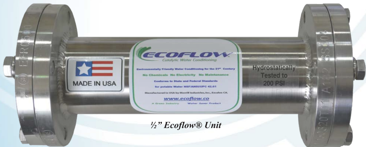
½" Ecoflow® Unit

The Ecoflow® Unit has years of scientific studies and research and development that have led to the product we offer you today.